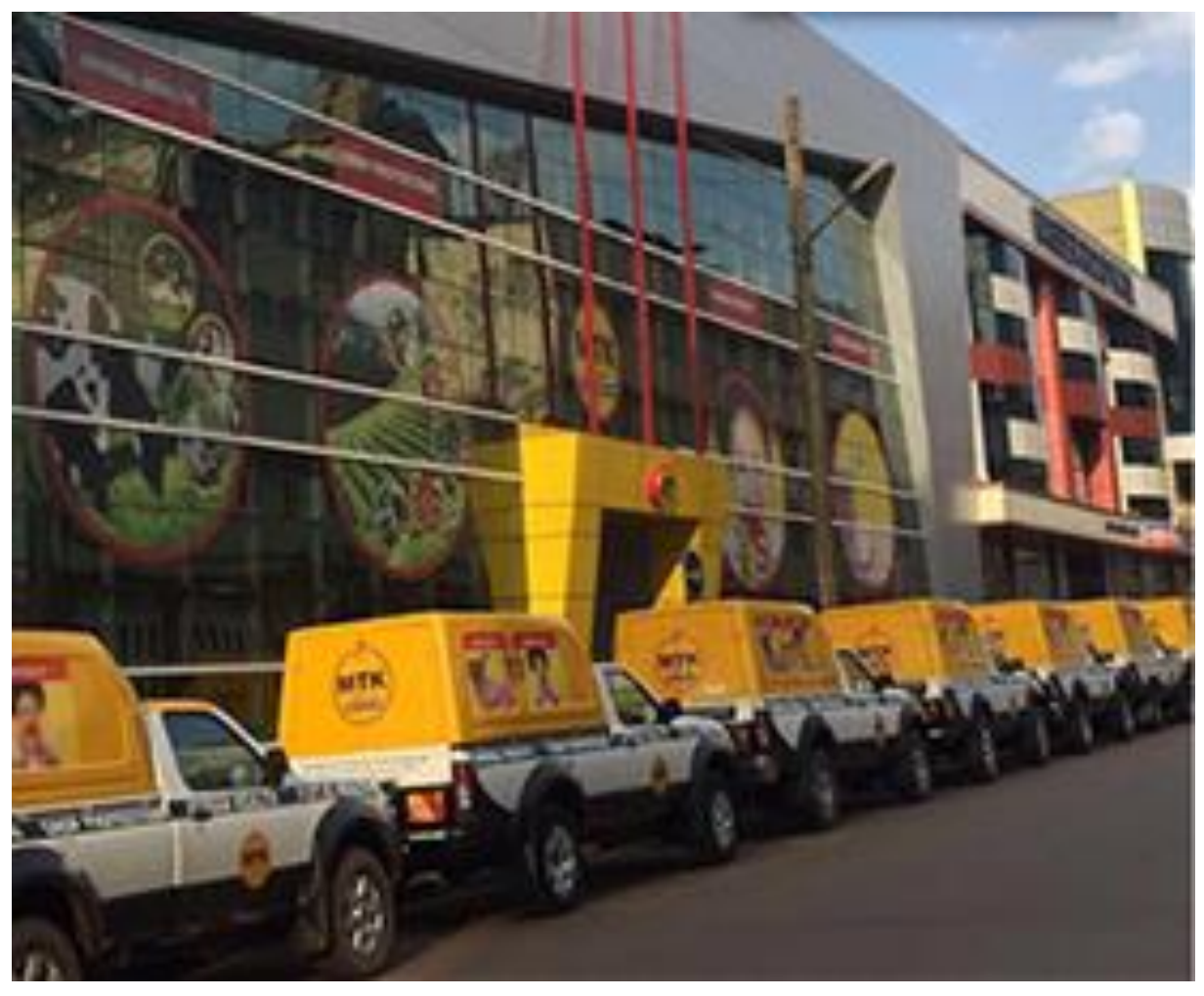
Quality Health Care Sustainability Report 2019